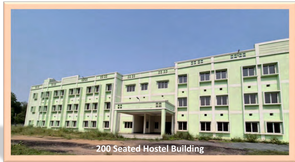
200 Seated Hostel Building