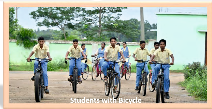
Students with Bicycle